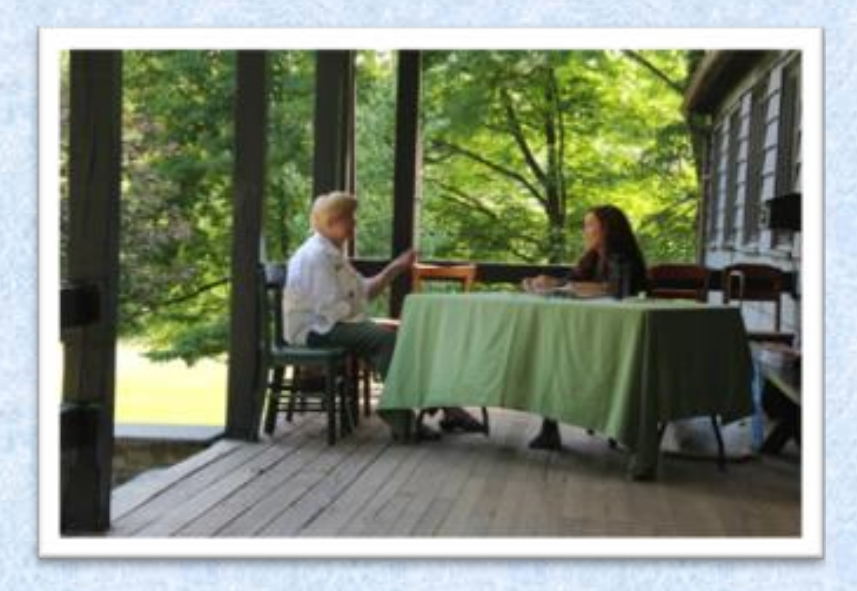
A parent talks with our Camp Nurse at Check-In.

Here are a couple things to help you through this. First of all, know that if any issues arise with your camper, we will contact you as soon as possible. If it's a medical issue our Camp Nurse will call, and if there is a behavioral issue or anything else one of our camp directors will get in touch. Likewise, if you have any concern or issue you can always get in touch with us at the camp office. If you call and ask for a report on how your camper is doing, we'll speak with their counselors and observe the camper in action, and call back in a couple hours to let you know how your child is holding up. Parents have told us they found their child's week at camp taught them as much about independence and time away as it did their camper.