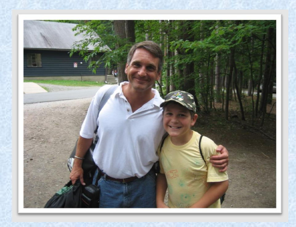
Your Questions are Important to Us

Parents have questions. Lots of them! You want to know every aspect of camp, and we want you to know everything you need to know to make your child's stay as warm and as welcoming as possible.